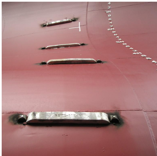
BEME HULL GRIP on vessel

BEME HULL GRIP offers you the following advantages: